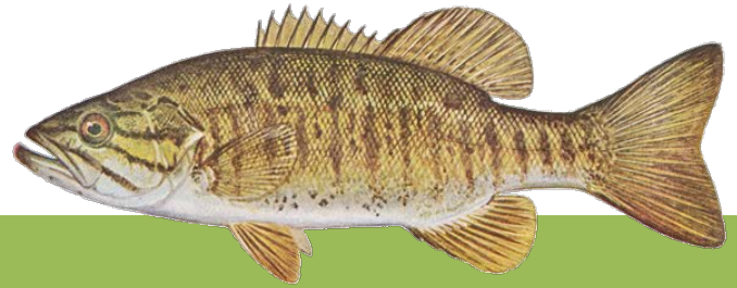
Smallmouth Bass ( Micropterus dolomieu )